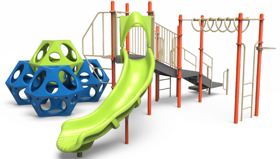
$26,367 $17,139 350-2172 • Space Required: 33' 8" x 32' 0" • Ages: 5-12 • Users: 33