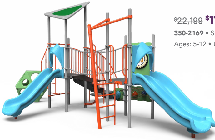
$22,199 $17,759 350-2169 • Space Required: 38' 8" x 29' 0" Ages: 5-12 • Users: 32