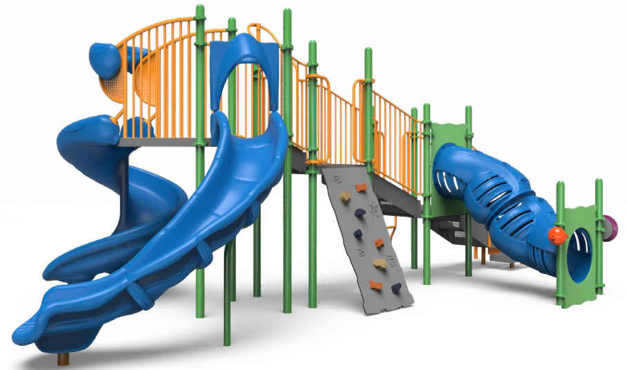
$26,136 $16,988 350-2173 • Space Required: 38' 0" x 28' 0" • Ages: 5-12 • Users: 27