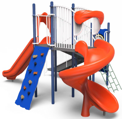
$22,797 $15,958 350-2171 • Space Required: 26' 1" x 31' 0" Ages: 5-12 • Users: 24